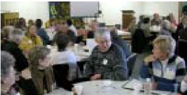
The "President's Breakfast" meeting, all participants were involved in group discussions. Many topics were assigned, such as: Club Management, Education Programs, Running an Effective Meeting, Club Programs, Portfolio Management and NAIC Resources.

We strive to provide programs, which will aid individuals and strengthen the clubs in our area. We hope you will take advantage of our offerings and challenge us to meet your club's needs.