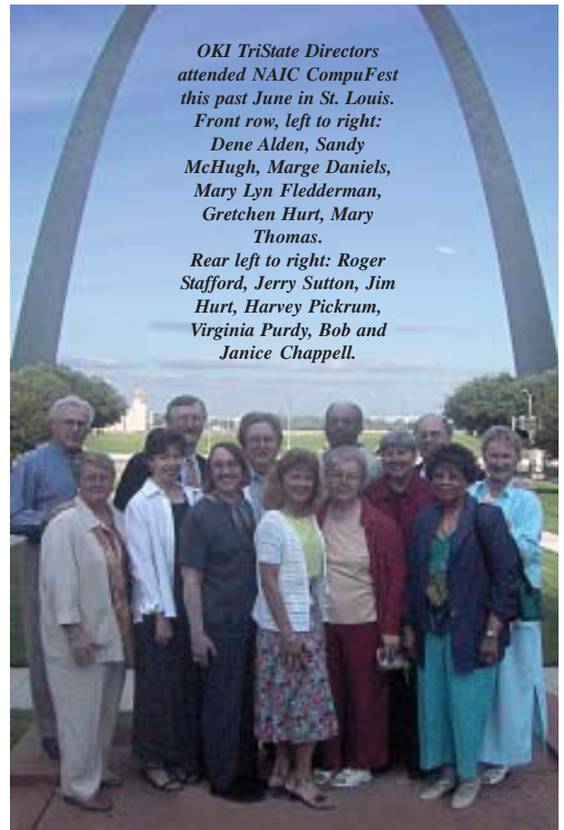
OKI TriState Directors attended NAIC CompuFest this past June in St. Louis.

The Computer Users Group meets on the third Monday of every month from Sept. through May at the Lane Public Library, 1485 Corydale Drive, Fairfield, Ohio. Meetings begin at 6:30 P.M. and end at 8:45 P.M.