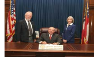
Governor Welcomes BINC to Georgia